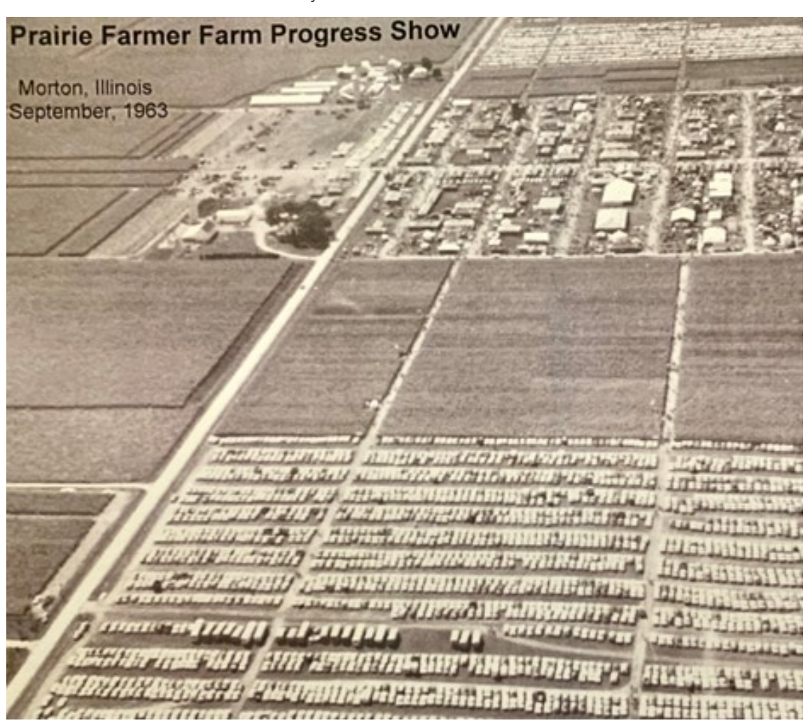
This 1963 photo shows the Jim Yordy farm at the top left. Running along the middle of the photo is Fourth Street, south of Morton. The parking lot is at the bottom. The area between the parking lots and the exhibits contains test plots of field crops for demonstrations of farm equipment.